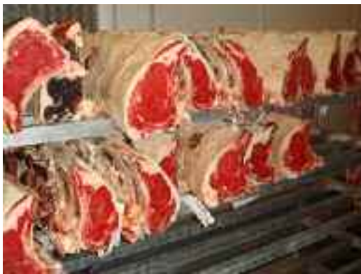
RIBS OF BEEF