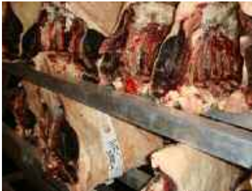
DRY AGED BEEF

Here are some photographs of our product selection: